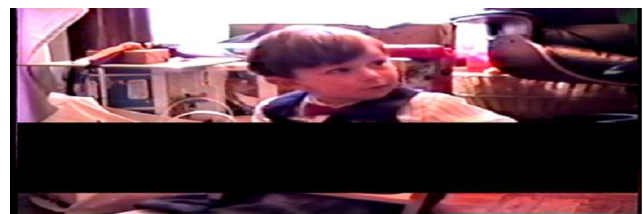
(a) Input image with significant missing data

If we can restrict motions among images to be parametric form, then it is trivial to compute motion fields using remaining valid pixels. Unfortunately, such restriction is not realistic. For example, the three images used in Fig. 1 undergo significant local motions especially in the missing region. This is clearly illustrated in Fig. 1(c) where the two warped images based on affine model are significantly different. In this paper, we adopt dense optical flow as our motion model. Hence, the key technical challenge is how to compute optical flow in regions of missing pixels. To solve the problem of computing flow without correspondence (due to missing pixels), we propose an effective multi-resolution, multi-frame flow method. If we view an