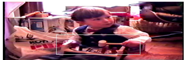
(b) Repaired image based on motion reconstruction