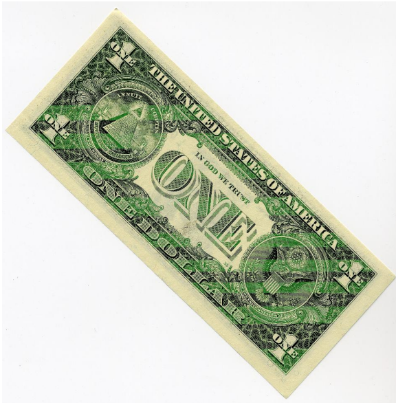
Fig. 4. Selective mis-rendering of obverse of US currency. Observe that the bands are visible even if printed at an angle.