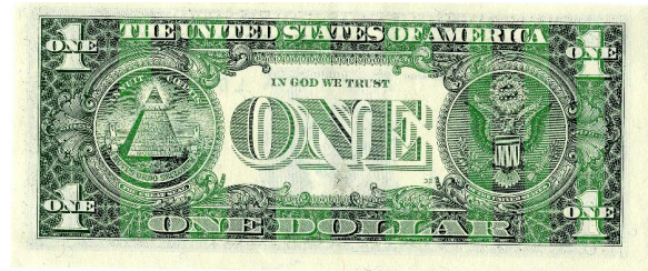
Fig. 2. Selective mis-rendering of obverse of US currency. Once greater than a threshold amount of banknote green is used that color is dynamically mis-rendered using the distortion function in Figure 1. The visible bands of alternating light and dark green make the note difficult to pass. Note the bands are designed to be clearly visible when printed with accurate color reproduction on an inkjet printer. They may be more or less visible for monitor or other print conditions.

Next, we address these two requirements in turn.