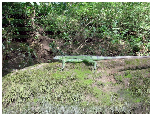
Fig. 5. Selective mis-rendering of image. Once greater than a threshold amount of banknote green is used that color is dynamically mis-rendered as a function of color used. Above: original image with S(\mathbf{x}) > T_s . Below: image rendered with distortion function shown in Figure 1.

features difficult is deliberate unpredictability of alignment. Generally printers start rendering at the top left corner of a page, and dependably begin at a certain location. If instead we jitter the begin location by a small random amount vertically and horizontally we make it very difficult to align the front and back accurately. That is, if the top left of the page is (0, 0) , the printer may generally begin printing at a position (x_0, y_0) . If this is dependable and repeatable a counterfeiter may produce notes with excellent “see-through” reproduction. Instead however, once S(\mathbf{x}) > S(\mathbf{x}_{\$20})/5 , and the document is regarded as suspicious, we render subsequent pages instead starting at (x_0, y_0) + (\Delta_x, \Delta_y) where both \Delta_x and \Delta_y are random numbers uniformly distributed on (-2.5mm, 2.5mm) . Thus in printing a suspicious document a counterfeiter cannot count on alignment better than 5mm. This makes it very difficult to produce accurate renditions of “see-throughs.” An example is shown in Figure 3.