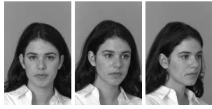
Fig. 2. Images of subject 01169 from the FERET database for 0^\circ , +25^\circ and +60^\circ views (left to right); note that the angles are approximate.