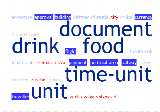
Fig. 3. Refactored tag cloud. Similar tags have been added to the scope of their corresponding and most significant tag. As consequence, we obtain a free-of-redundancies tag cloud where new terms can be included.

We show an example (Table 2) of mappings that MaSiMe has been able to discover from [11] and [12]. We have compared the results with two of the most outstanding tools: FOAM [13] and RiMOM [14].