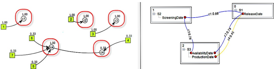
Fig. 3. The GUI of ArgSM, with Argumentation view (left) and Schema view (right)

To show the efficiency of the above techniques, we set up an experiment to measure the response time of computing arguments and attacks for a large network. With the help of automatic matchers, we obtain 472 correspondences in the network. Since the network is large, it is partitioned into 21 clusters, in which smallest and biggest ones contain